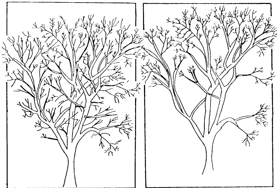
Fig. 1. Before and after pruning trees to reduce attractiveness as a bird roost.

Habitat modifications include a myriad of activities that can make