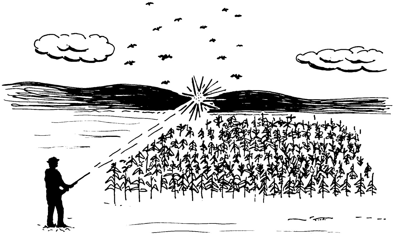
Fig. 3. Shell crackers are fired from a 12-gauge shotgun. They produce an aerial explosion and can be useful in frightening birds out of fields or away from roosts.